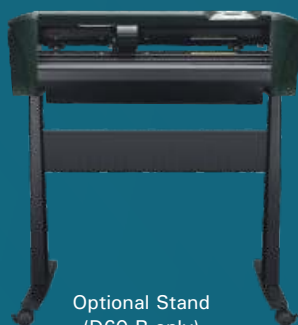
Optional Stand (D60-R only)