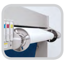
Load up to 42-inch-wide bond, tracing paper, vellum or film rolls.