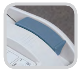
Easy printer access for paper loading, serviceability, etc.